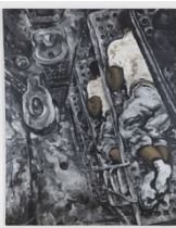
Martin Wong Prison Bunk Beds , c. 1988-1992 acrylic on canvas 60 x 48 ins. 152.4 x 121.9 cm