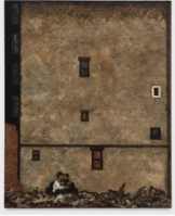
Martin Wong Sharp & Dottie , 1984 acrylic on canvas 60 x 48 in. 152.4 x 121.92 cm