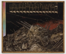
Martin Wong Everything Must Go, 1983 acrylic on canvas with hand-painted frame 48 x 60 ins. 121.9 x 152.4 cm