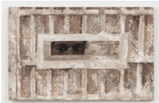
Martin Wong Cell Door Slot, 1986 acrylic on canvas 18 x 28 in. 45.7 x 71.1 cm