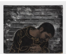
Martin Wong Angelito , 1992 signed verso acrylic on canvas 24 x 30 in. 61 x 76.2 cm