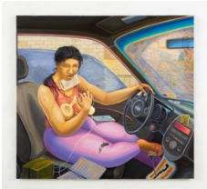
Aaron Gilbert Summons , 2020 oil on canvas 35 x 38 ins. 88.9 x 96.5 cm