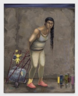
Aaron Gilbert Goddess Walks Among Us Now , 2020 oil on canvas 60 x 48 ins. 152.4 x 121.9 cm