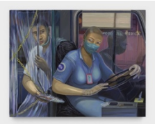
Aaron Gilbert Nightshift B15 , 2020 oil on linen 30 x 38 ins. 76.2 x 96.5 cm