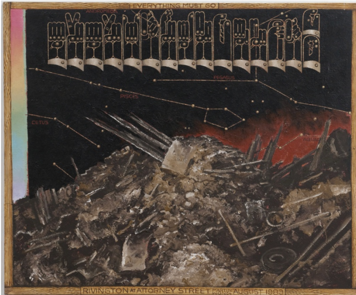
Martin Wong, Everything Must Go , 1983, acrylic on canvas, 48 x 60 inches