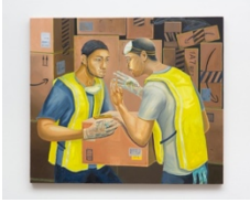
Aaron Gilbert Conspirators, 2020 oil on canvas 38 x 40 ins. 96.5 x 101.6 cm