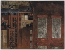
Martin Wong Nocturne at Ridge Street and Stanton , 1987 acrylic on canvas 72 x 96 ins. 182.9 x 243.8 cm