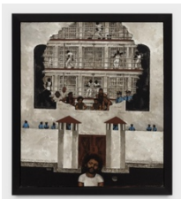
Martin Wong Penitentiary Fox , 1988 acrylic on canvas 64 x 56 in. 162.6 x 142.2 cm