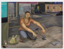
Aaron Gilbert Infrared (T-Mobile) , 2021 oil on canvas 42 x 56 ins. 106.7 x 142.2 cm