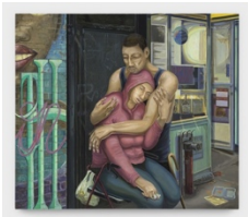
Aaron Gilbert Empire State of Mind/Flaco 730 Broadway, 2020 oil on linen 40 x 46 ins. 101.6 x 116.8 cm