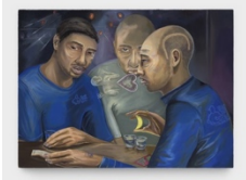
Aaron Gilbert Ready Willing and Able , 2020 oil on linen 20 1/2 x 28 ins. 52.1 x 71.1 cm