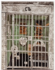
Martin Wong Lock-Up, 1985 acrylic on canvas 92 x 70 ins. 233.7 x 177.8 cm