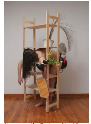
Kinga, c-print, 60 x 47 inches, edition of 5

P·P·O·W Gallery is pleased to announce our first solo exhibition of the Dutch artist, Melanie Bonajo. As Thrown Down from Heaven , is a photo series that focuses on a theme that Bonajo continually explores; the relationships that human beings have with the environment, both private and public, and the desire to create harmony within this. The images in this series combine seemingly opposing elements, nude figures with disposable objects, but when combined these figures become a fusion of the individual and the material, becoming a hybrid that expresses our modern age.